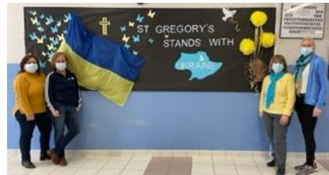
Our EA Team created this beautiful bulletin in honour of #StandWithUkraine campaign